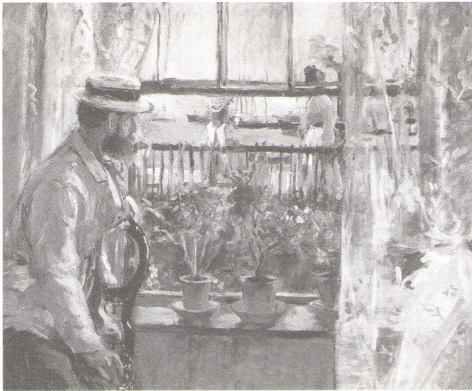
Berthe Morisot, Eugene Manet on the Isle of Wight , 1875. Oil on canvas, 15 x 18 1/8 in. (38 x 46 cm)