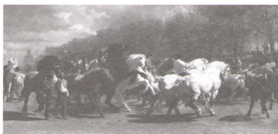
Rosa Bonheur, The Horse Fair , 1852–55. Oil on canvas, 96 3 / 8 x 199 1 / 2 in. (244.5 x 506.7 cm)

The difficulties imposed by such demands on the woman artist continue to add to her already difficult enterprise even today. Compare, for example, the noted contemporary, Louise