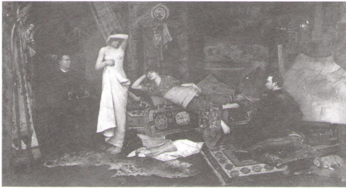
Maurice Bompard, Un début à l'atelier , 1881. Oil on canvas, 88 \frac{5}{8} x 166 \frac{1}{8} in. (225 x 422 cm)

As an example of the unconscious aura of titillation that arises from a visual representation of an aspiring woman artist in the mid-19th century, Emily Mary Osborn's heartfelt painting, Nameless and Friendless , 1857 [p. 59], a canvas representing a poor but lovely and respectable young girl at a London art dealer, nervously awaiting the verdict of the pompous proprietor about the worth of her canvases while two ogling "art lovers" look on, is really not too different in its underlying assumptions from an overtly salacious work like Bompard's Un début à l'atelier . The theme in both is innocence, delicious feminine innocence, exposed to the world. It is the charming vulnerability of the young woman artist, like that of the hesitating model, which is really the subject of Miss Osborn's painting, not the value of the young woman's work or her pride in it: the issue here is, as usual, sexual rather than serious. Always a model but never an artist might well have served as the motto of the seriously aspiring young woman in the arts of the 19th century.