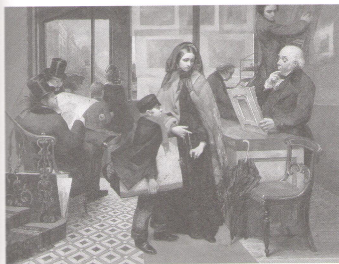
Emily Mary Osborn, Nameless and Friendless , 1857. Oil on canvas, 32½ x 40⅞ in. (82.5 x 103.8 cm)

That achievement in the arts, as in any field of endeavor, demands struggle and sacrifice, no one would deny; that this has certainly been true after the middle of the 19th century, when the traditional institutions of artistic support and patronage no longer fulfilled their customary obligations, is undeniable: one has only to think of Delacroix, Courbet, Degas, Van Gogh and Toulouse-Lautrec as examples of great artists who gave up the distractions and obligations of family life, at least in part, so that they could pursue their artistic careers more single-mindedly.