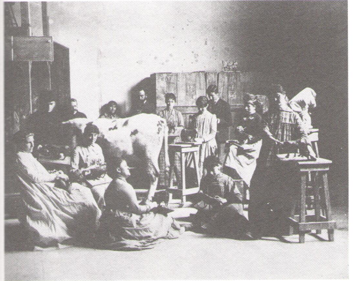
At Thomas Eakins' life-class at the Pennsylvania Academy around 1855, a cow, instead of a nude man, served as a model for the women students.

The women in the Women's Modeling Class at the Pennsylvania Academy were evidently not allowed even this modest privilege. A photograph by Thomas Eakins of about 1885 reveals these students modeling from a cow (bull? ox? the nether regions are obscure in the photograph), a naked cow to be sure, perhaps a daring liberty when one considers that even piano legs might be concealed beneath pantalettes during this era (the idea of introducing a bovine model into the artist's studio stems from Courbet, who brought a bull into his short-lived studio academy in the 1860s). Only at the very end of the 19th century, in the relatively liberated and open atmosphere of Repin's studio and circle in Russia, do we find representations of women art students working uninhibitedly from the nude—the female model, to be sure—in the company of men. Even in this case, it must be noted that certain photographs represent a private sketch