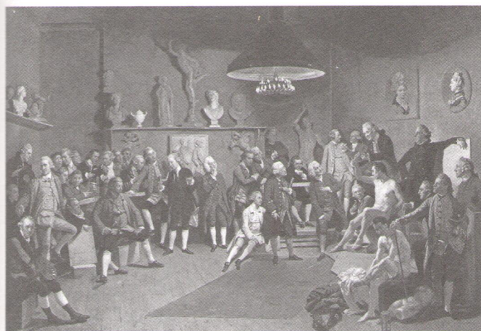
Johann Zoffany, The Academicians of the Royal Academy , 1771–72.