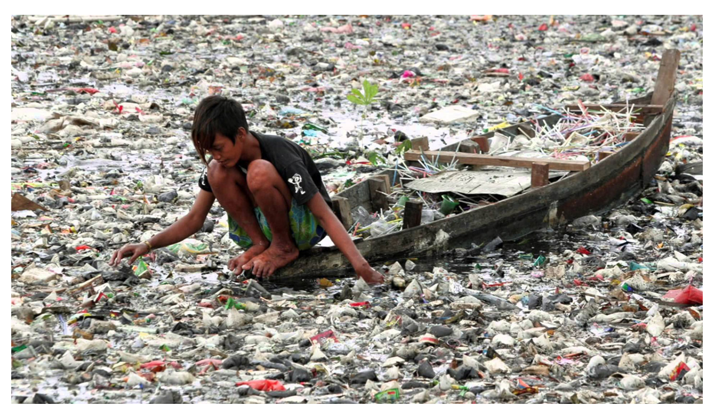
The Citarum River, Indonesia, is considered one of the most poluted in the world.

However, the best critique of the ideological premises of the white cube remains a series of essays written by Brian O'Doherty in 1976, collected in Inside the White Cube: The Ideology of the Gallery Space . Writing from within the context of post-minimalism and conceptual art of the 1970s, but also from the point of view of artistic practice, O'Doherty argues that the gallery space is not a neutral container, but a historical construct. The white cube divides that