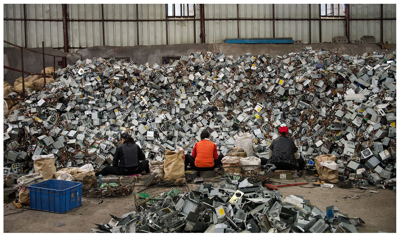
Workers sorting electronic waste in China.