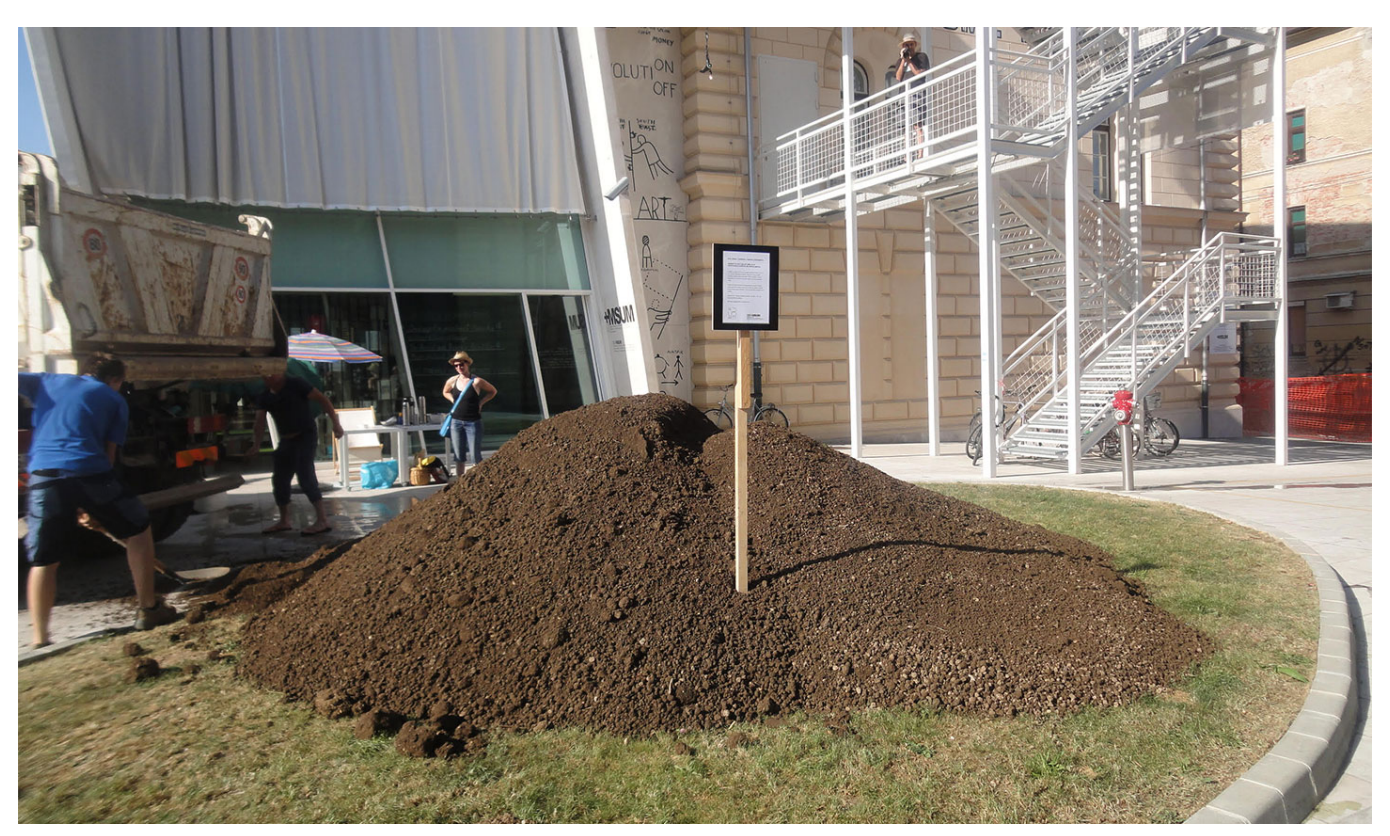
"Greetings from Beyond the Construction Site," an action by the KUD Obrat collective at the opening of "Resilience: U3 – Triennial of Contemporary Art in Slovenia," Museum of Modern Art, Ljubljana, 2013.

Resilient thinking looks at the critical and dystopian near future; unable to anticipate or postpone it, it can only react by adapting to it. "Your utopia, my dystopia," said Françoise Vergès recently, in the framework of the project Atelier, a research group that has been meeting