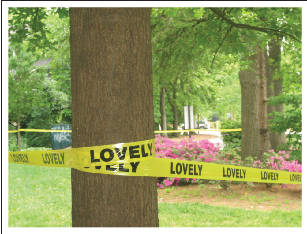
Figure 2. Stephanie Brooks, “Lovely/Caution.”

the same time, the proclamation of “the common,” its manifestic function, is always political and invested in counter-sovereignty, with performative aspirations to decolonize an actual and social space that has been inhabited by empire, capitalism, and land-right power. 9