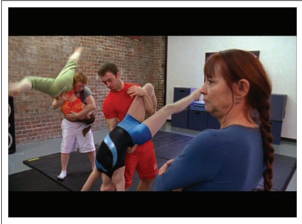
Figure 5. Cirque d'Art.

The film is about the neighborhood kids, its current crop of dreamers: they are protagonists in training. The training comes from the only live collective space we see in the town, a circus school that is called, in real life, but not in the film, Cirque d'Art . We see the teacher in the front of the room, and she is getting the group in sync, to do tricks. The kids are learning to spin and to fall. They are learning to lean on each other (Figure 5). A little light romance might be starting, but also autonomy and abs are developing so that a person can hold a whole body up in the air while the partner's elevated body swings inverted. None of this feels like the preenactment of fantasies of stardom or love. It does not feel fantasmatic, or allegorical, at all: learning to be awkward, to be graceful, to leap, and to fall is a training in attention and also in revisceralizing one's bodily intuition. It is a training that collapses getting hurt with making a life, but that includes the welcoming of exposure alongside of a dread of it. There can be no change in life without revisceralization. This involves all kinds of loss and transitional suspension.